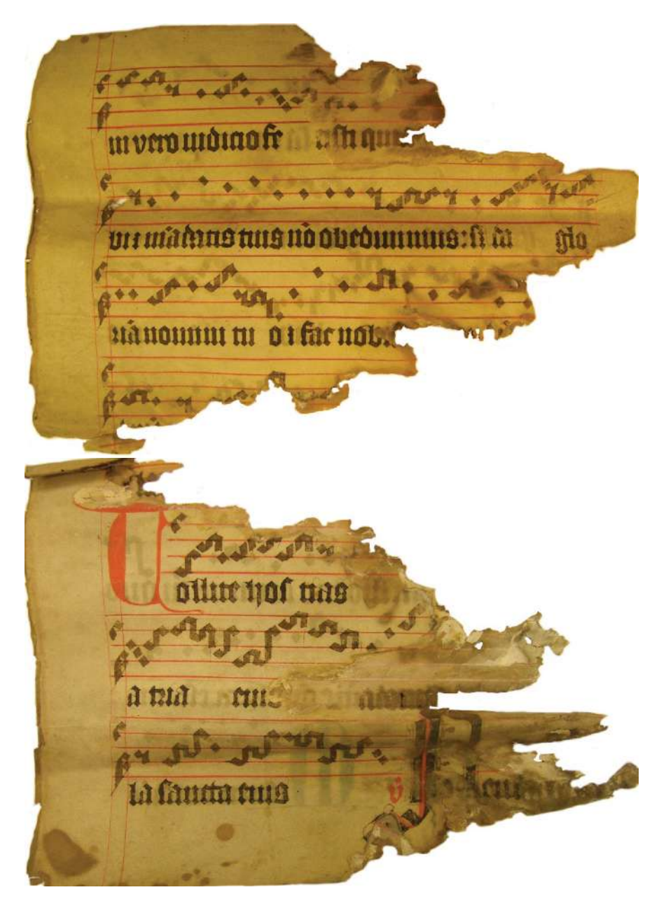
Fig. 2a: Szombathely, Diocesan Archives, fragment V. 48/E. fasc., recto; © Szombathely, Diocesan Archives.