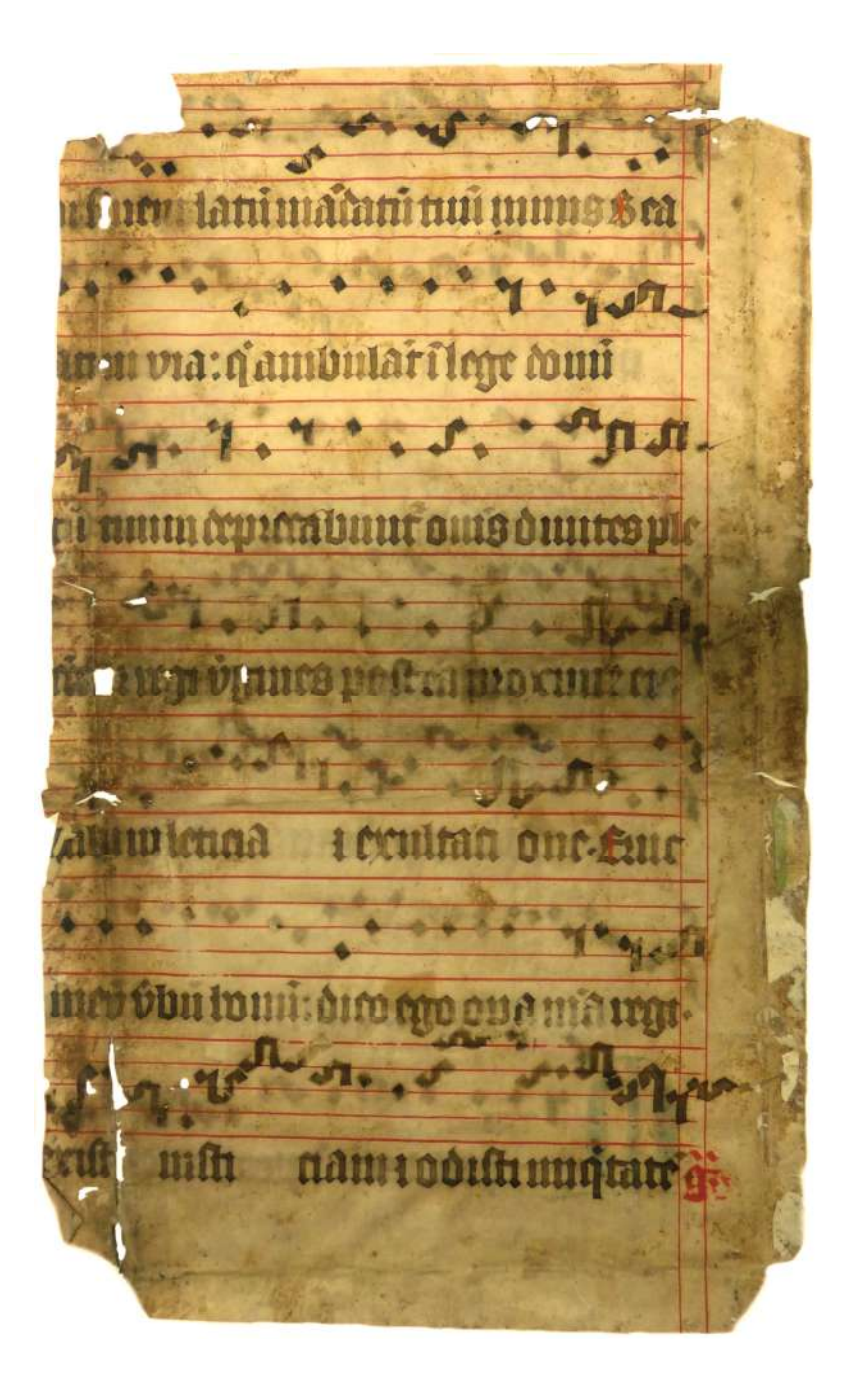
Fig. 3b: Szombathely, Diocesan Library, fragment sine sign., verso