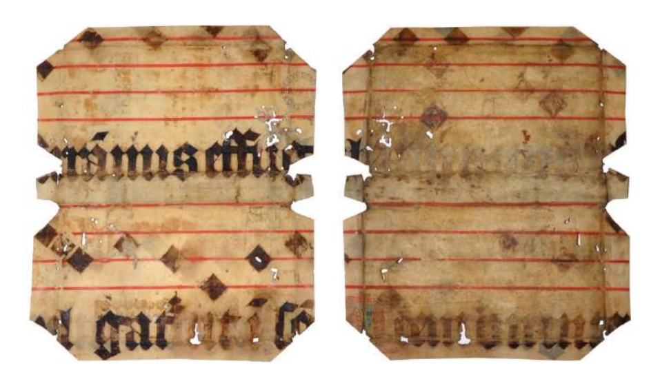
Fig. 4: Budapest, University Library, fragment removed from RMK III/463, recto (left) and verso (right); © Budapest, University Library.

the cathedral, probably compiled in one of the leading scriptoria of Bohemia or Moravia; the monumental rhombic notation and the rich decorative style of the manuscript are similar to that of many late fifteenth- and early sixteenth-century Bohemian codices.<sup>36</sup>