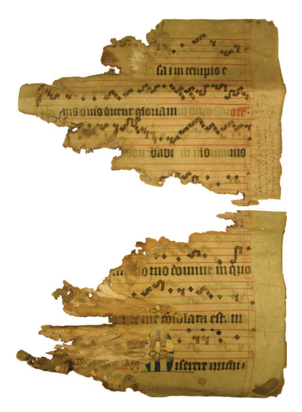
Fig. 2b: Szombathely, Diocesan Archives, fragment V. 48/E. fasc., verso; © Szombathely, Diocesan Archives.