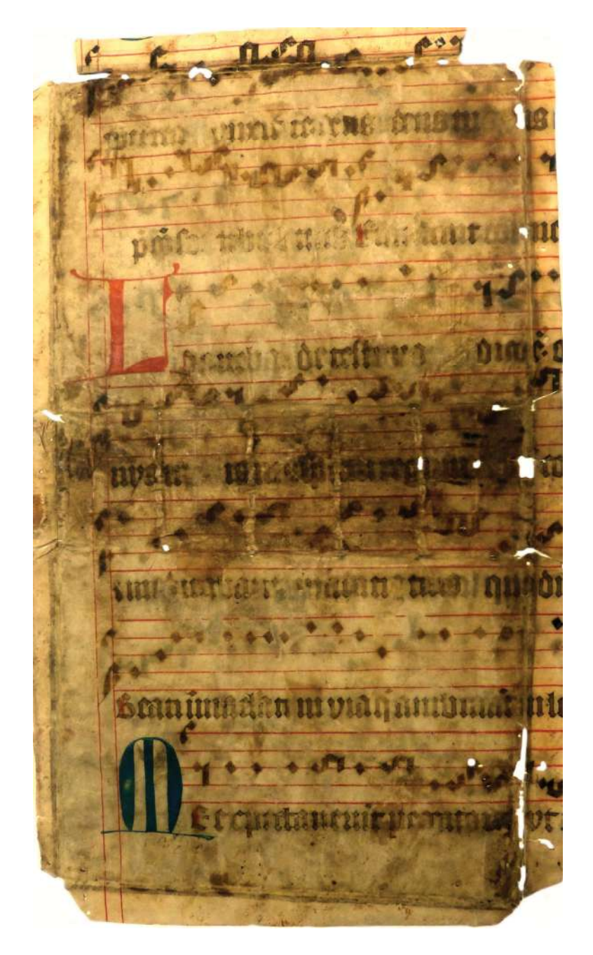
\textbf{Fig. 3a:} \ \textbf{Szombathely, Diocesan Library, fragment} \ \textit{sine sign.}, \textbf{recto;} \ \textcircled{\textbf{0}} \ \textbf{Szombathely, Diocesan Library}